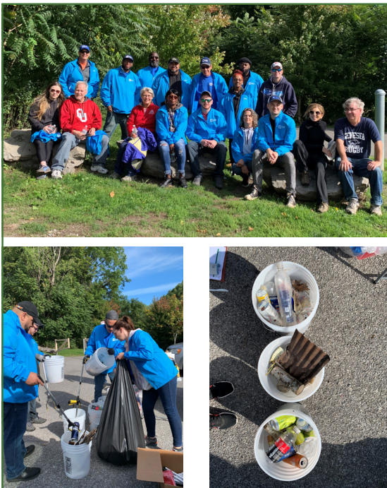
Figure 3: The EL&C and Chili groups in New York Cleaned up at Turning Point Park along the Genesee River in Rochester

On Sept 17, millions of volunteers, governments, and organizations set forth to tackle the global waste problem. In honor of this day, many APC employees volunteered their time at local community events. I want to highlight just a few of the events that occurred in honor of this day.