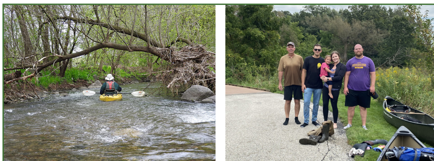
Figure 5: The Columbus / Deforest, WI team participated in the Yahara River Clean-up. Fortunately, the amount of litter collected was limited but the group did have the opportunity to free the river from some fallen trees and obstructions.