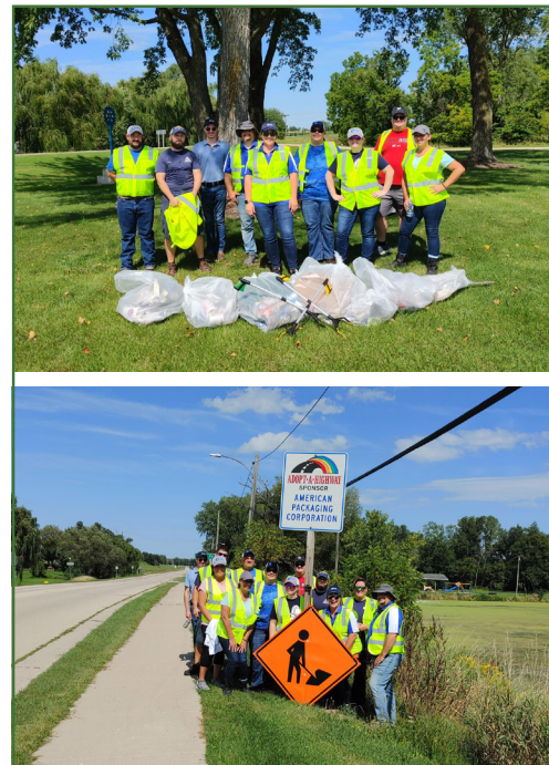
Figure 4: The Roto team in Columbus / Deforest, Wisconsin participated in the Adopt-a-Highway roadside clean-up activity