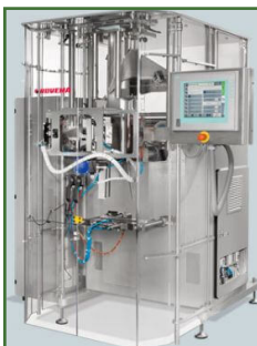
Figure 1: VFFS Machine

Salted snacks, confections, salad mixes, and condiments are examples of products that are often packaged on VFFS (vertical form fill seal) machines. Compared to alternative packaging equipment, VFFS machines bring value as they minimize floor space and work well for loose, granulated, doughy, or difficult to handle materials that can offer material conveyance challenges.